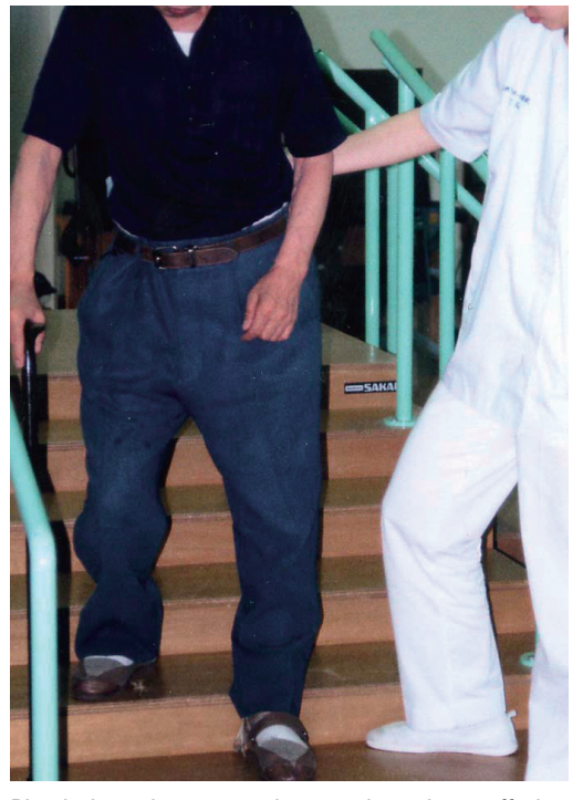
Physiotherapist uses stairs to train patient suffering from paralysis of the left side of the body.