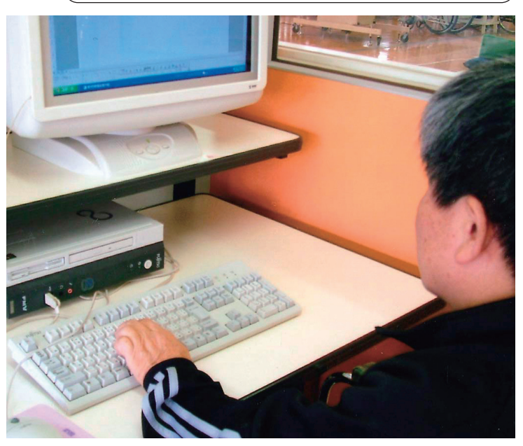
Occupational therapist uses a PC to train patient suffering from paralysis of the left hand.